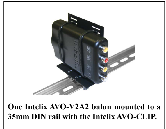
One Intelix AVO-V2A2 balun mounted to a 35mm DIN rail with the Intelix AVO-CLIP.