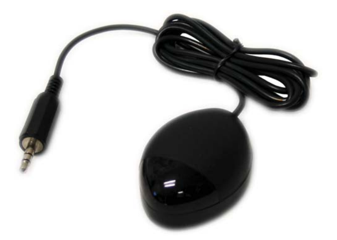
The optional IR extender allows you to relocate your HDMI Switcher and still have IR control of the HDMI Switcher