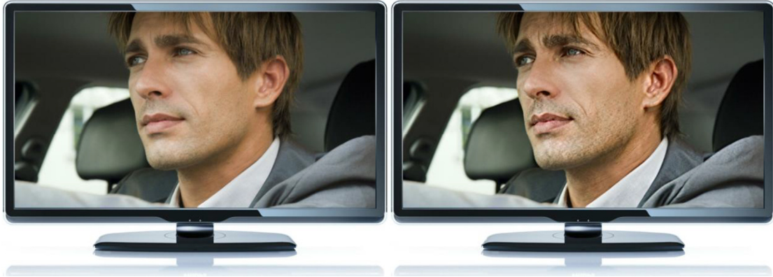
Ordinary High Def