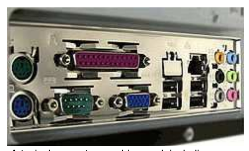
A typical computer graphics card, including a wide variety of video and audio connections.

However, many computers only offer VGA outputs. Many television manufacturers have eliminated "non-essential" inputs from their digital televisions to cut costs, so you may be presented with a mixture of inputs – composite, s-video, component, or HDMI. These may not be directly compatible with your computer.