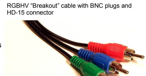
Component video cable (YPbPr) with RCA plugs

Component video uses the "YPbPr" colorspace, and its cables are often terminated with RCA or BNC plugs. Component video is sometimes erroneously referred to as RGB due to the common red, green, and blue coloration of its RCA jacks. RGB is not component video.