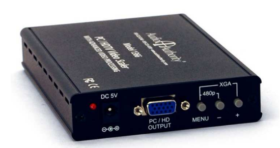
Model 1366 PC/HD Scaler

Audio Authority Corp. offers several devices to assist in overcoming these obstacles. These tools will enable even the uninitiated to display a computer's output successfully on a high definition television.