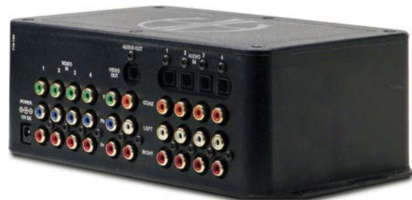
1154A rear panel