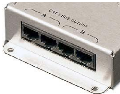
Each of the two Model 9871 Driver outputs works over a pair of inexpensive, easy to install Cat 5 cables. The wall-mountable 9870 system accepts digital and analog audio, and HD component video inputs.