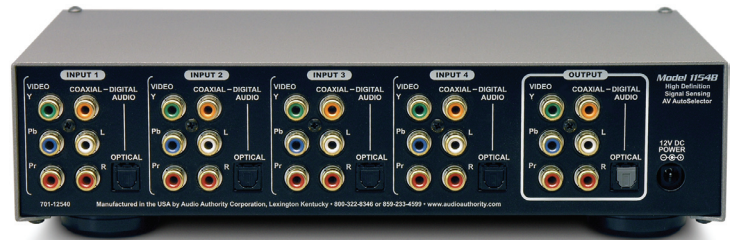
1154B rear panel